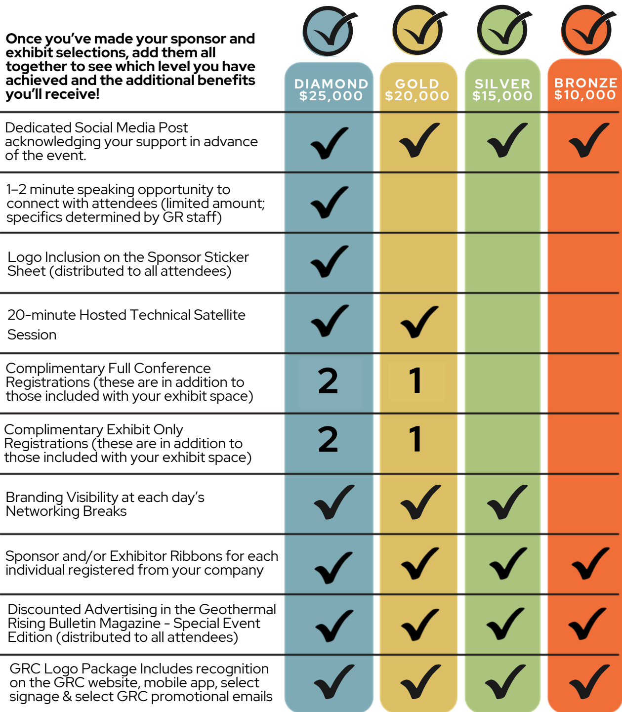
Exhibit + Sponsor Spend Combined Can Bring Added Benefits